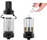
3 Top Filling System